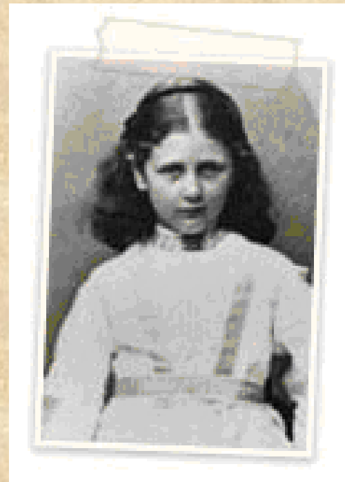
(Photograph: Beatrix, aged 9, courtesy of Warne Archive.)

A little girl in Victorian England, Beatrix Potter was taught at home by governesses and studied art while her brother was sent away to school. She was a shy, reserved personality when interacting with the outside world, but her secret diary written in her own code, revealed a lively young girl with highly critical opinions of her fellow artists.